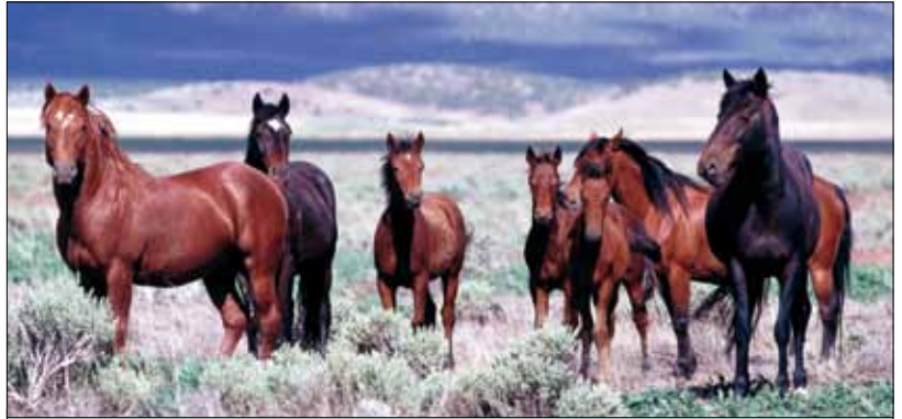
Free-ranging horses, Onaqui Herd, near Dugway, Utah

Management of horses and burros as metapopulations is necessary for their long-term genetic health. Genetic studies of horses on 102 Herd Management Areas show that the genetic diversity for most populations is similar to those of healthy mammal populations, although genetic diversity could change over time. Little is known about the genetic health of burros; the few studies that have been conducted reported low genetic diversity compared to domestic donkeys. To achieve optimal genetic diversity, managers could consider the collective populations of several Herd Management Areas as a single population. Management options include intensively managing individuals according to their genetic makeup within Herd Management Areas, moving horses and burros among these areas, or both.